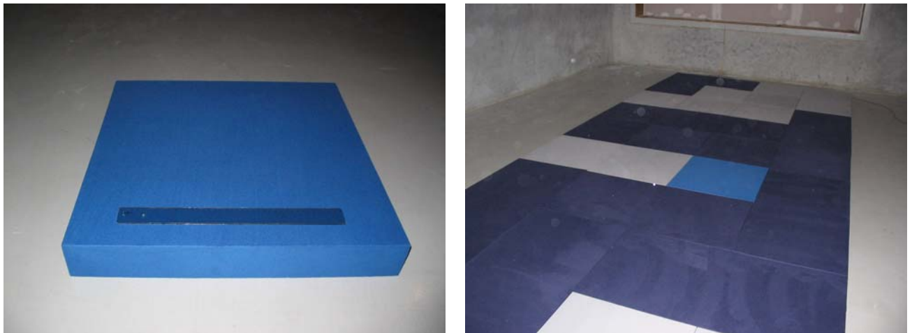
Fig. 1 and 2 – Sample (with sobrepõeção of a 40 cm ruler) and test assembly on the reverberant chamber floor.

The measured sample was tested on February 21, 2005 using panels of various dimensions (180x60 cm, 120x60 cm e 60x60 cm) with 12 cm width. The sample, with a total area of 10.35 m 2 , was placed on the floor of the reverberation room (see Fig 1 and 2).