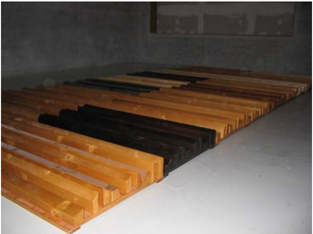
Fig. 1 and 2 – Sample (with sobreposition of a 40 cm ruler) and test assembly on the reverberant chamber floor